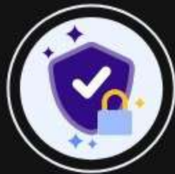
Audits & KYC